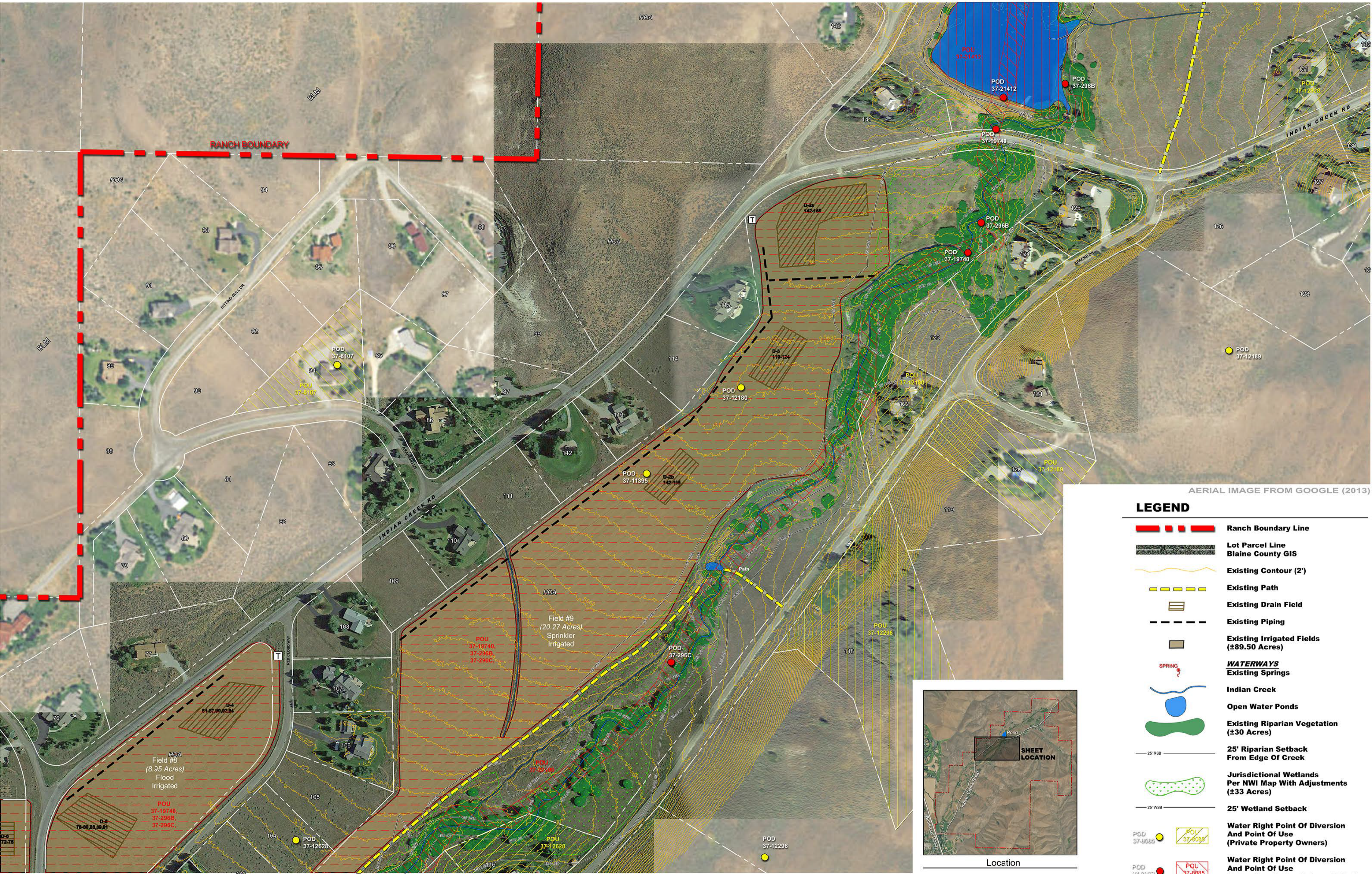
AERIAL IMAGE FROM GOOGLE (2013)